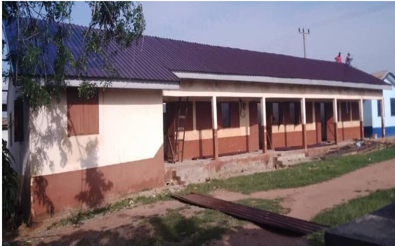
Fotobi M/A Basic School