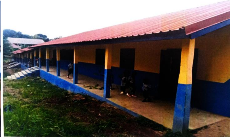
James White SDA Basic School